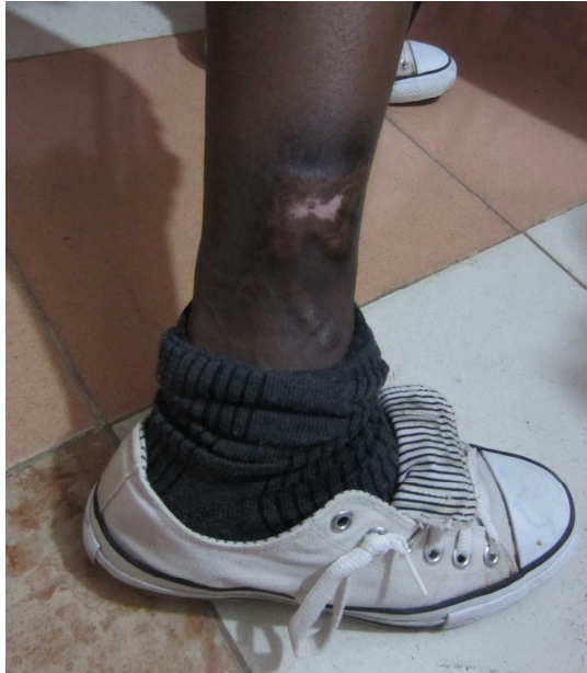
The ankle of a 17-year-old Eritrean boy showing the scars he said came from months of being chained by his captors in Sinai

He was freed once his community paid USD 27,000. Months after his release, there were visible scars on his ankles, compatible with his testimony of being chained for eight months.